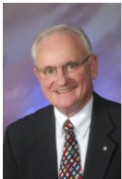
PRID Phil Silvers 5500