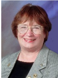
PDG Sandy Goodsite 5500